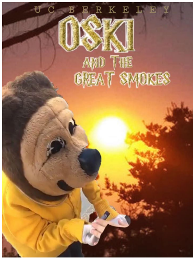
Figure 1: 2018