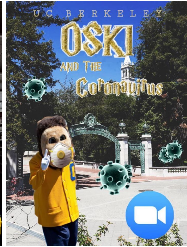
Figure 3: 2020