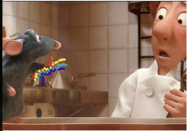
Figure 2: Ratatouille